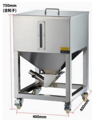
25kg Storage Drum