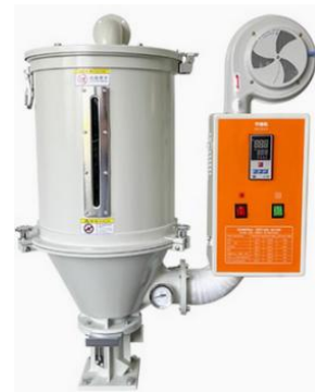
6 kg Dryer